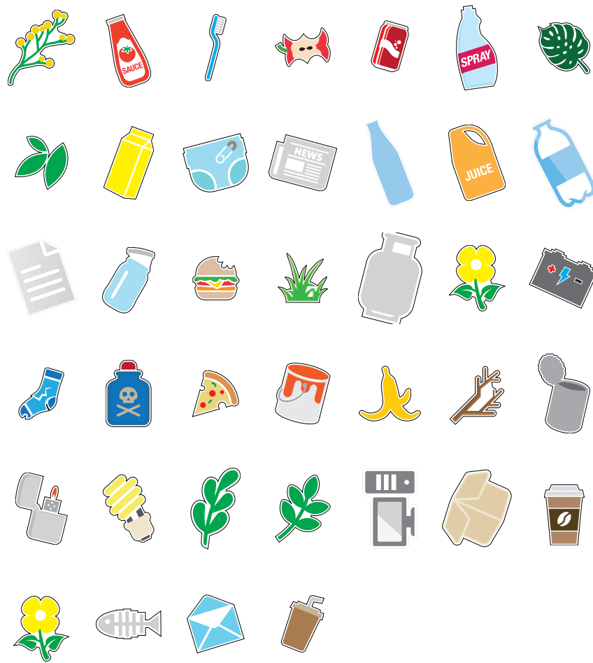
A5 icon die cut Bin icons are die cut and should be no larger than A5 in size.