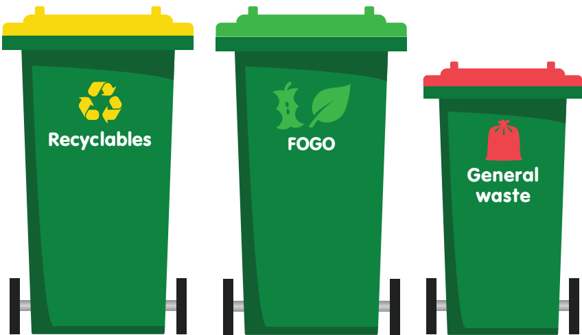
Bin die cut Bins should be at actual size for the booth templates.