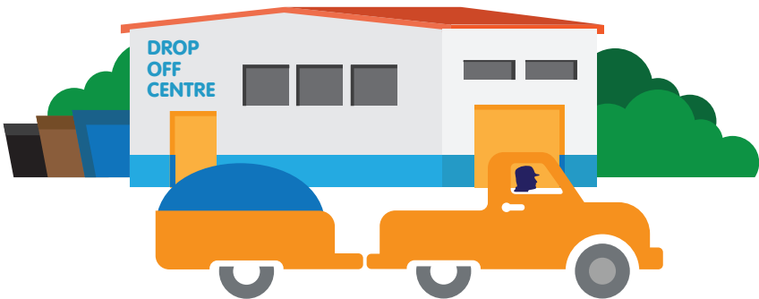
Drop off centre die cut: Height to be 50cm