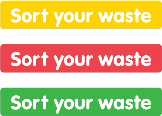
Heading panels Headings should be printed using one of the WasteSorted colours. Font is VAG rounded black. Words can either be printed on individual panels or multiple words on a panel.